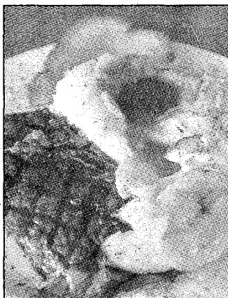
The Bourbon Street rib eye, with Josh Cloak's personal touch, is a best-seller.

The sports-themed Bull & Barrister is locally owned and offers many beers. The building at N.C. 16 and Mount Holly-Huntersville Road used to be Midtown Sundries.